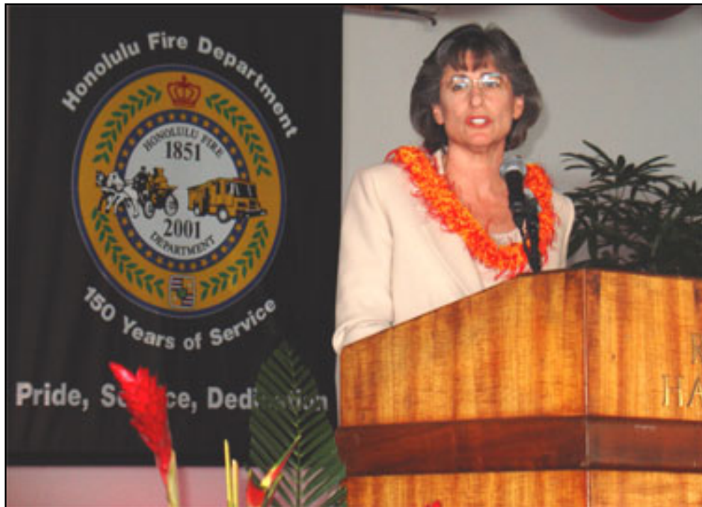
Governor Lingle joined The 200 Club of Honolulu in honoring local firefighters for their commitment and courage in protecting Hawai`i's residents and visitors.

Actors, directors, producers and other movie aficionados were welcomed to Washington Place by Governor Lingle during a reception for the Louis Vuitton Hawai`i International Film Festival. Among those in attendance were award-winning Chinese actress Maggie Cheung from "Hero," Australian actor David Wenham from "Lord of the Rings" and a delegation from the Shanghai International Film Festival. The Governor praised the Hawai`i festival for promoting cultural understanding between East and West and for highlighting the talents of local filmmakers. The festival continues through October 31. Additional information is available at www.hiff.org .