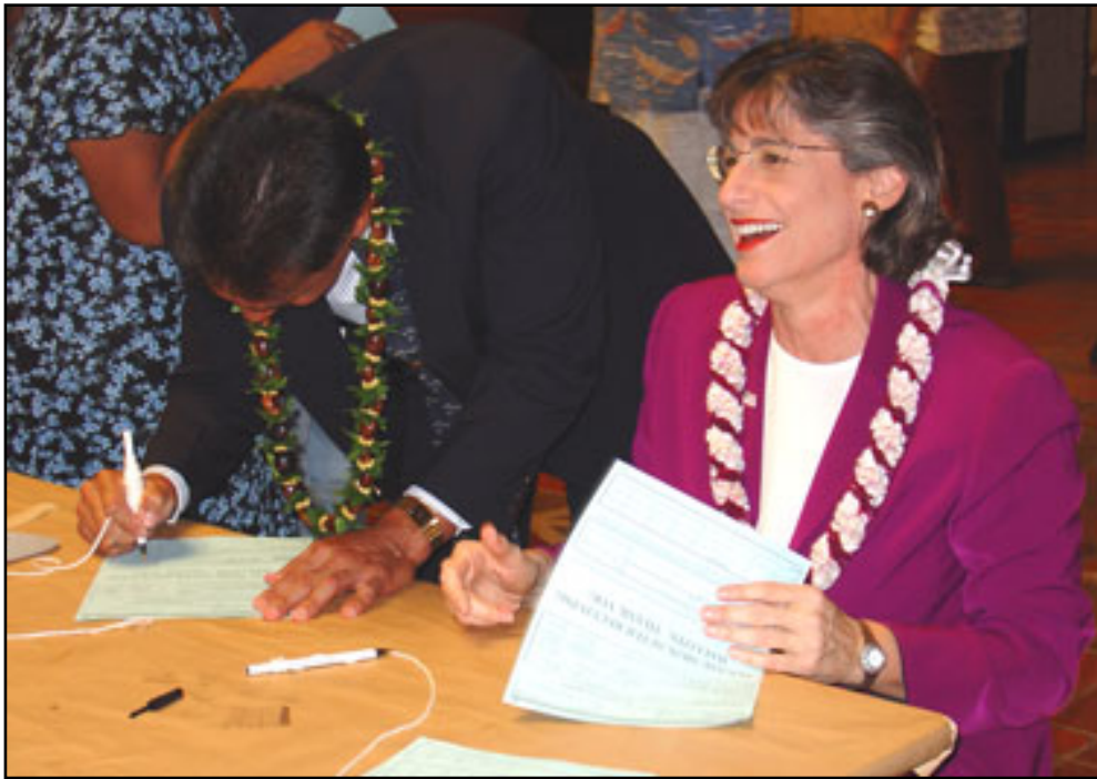
Governor Lingle and Lt. Governor Aiona were among those who voted early at Honolulu Hale this week.