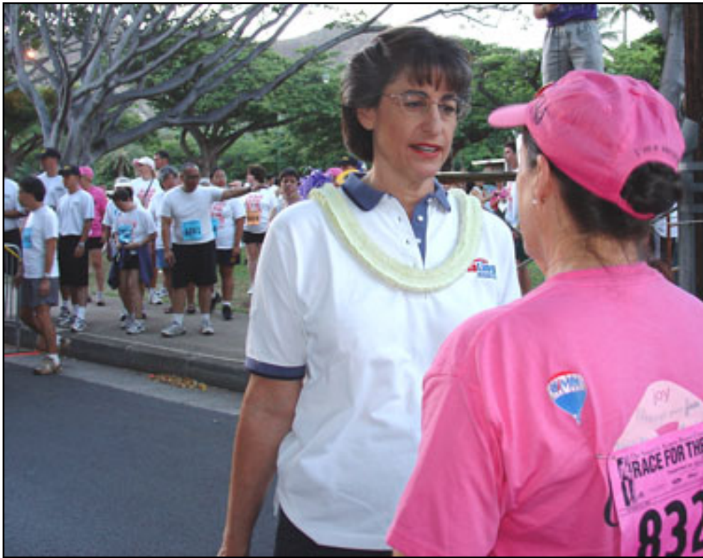
At the Komen Hawai`i Race for the Cure start line, Governor Lingle congratulated a survivor of breast cancer.